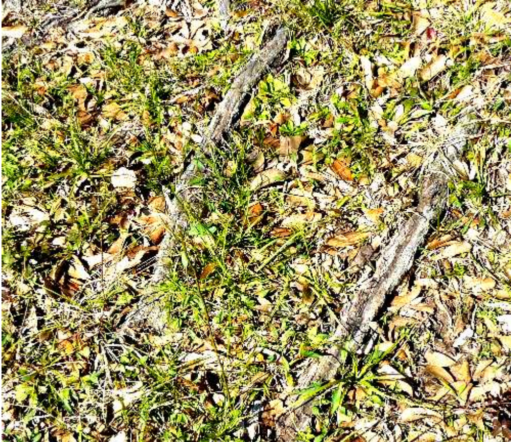
Tree roots at surface in trail route near WP D-177