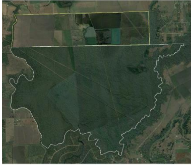
Burr Tract (Proposed CE) - 1,600 acres