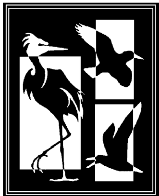
Friends of Brazoria Refuges