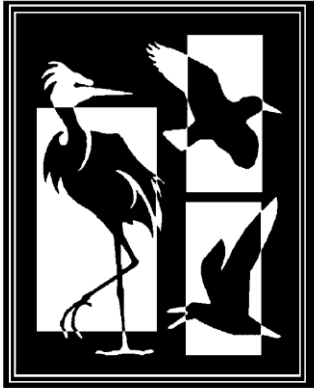
Friends of Brazoria Refuges