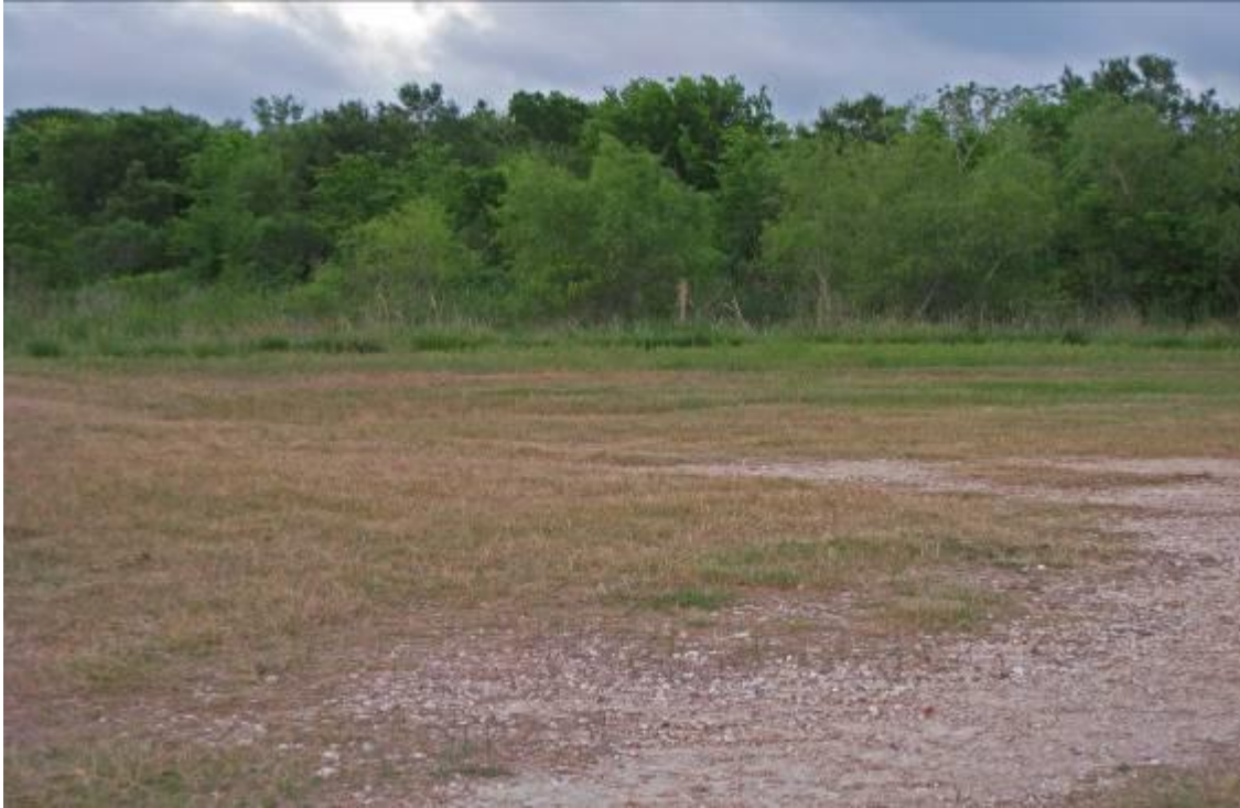
Proposed location of San Bernard Wolfweed DEEP Shelter