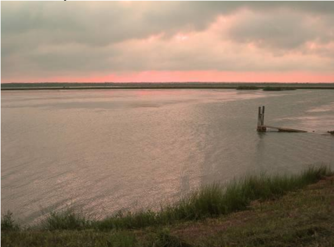
View of shallow wildlife management reservoirs approximately 100 feet from the proposed San Bernard Wolfweed DEEP Shelter