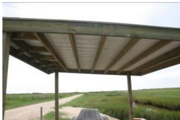
Shelter near the Discovery Center, BNWR